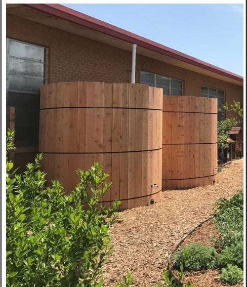
Two 2,500 gallon black poly tanks at South Plains College in Levelland were wrapped in cedar planks to make them more aesthetically pleasing.