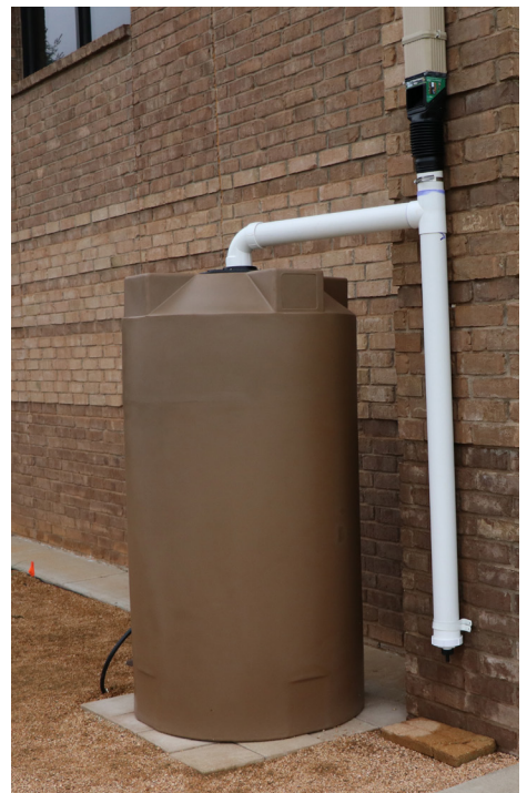
This 300 gallon rainwater harvesting system at the Wolfforth City Library is fitted with a first flush diverter and downspout filter.